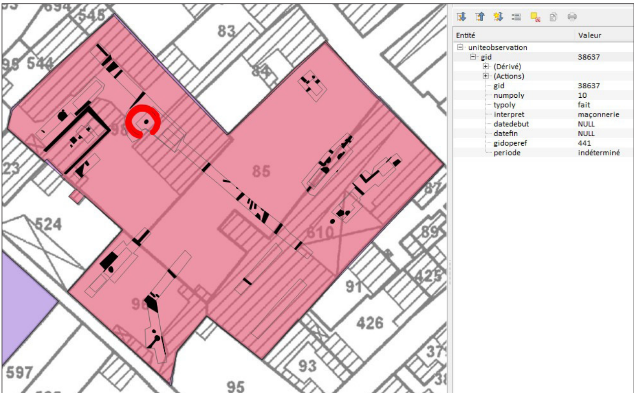
Figure 3: Spatial data is more than a place marker: much more spatial data was recorded by INRAP during the fieldwork, including both the project and trench extents as well as the locations of individual features.

The two examples presented here ( Figures 1–3 ) require the consistent application of data standards to combine